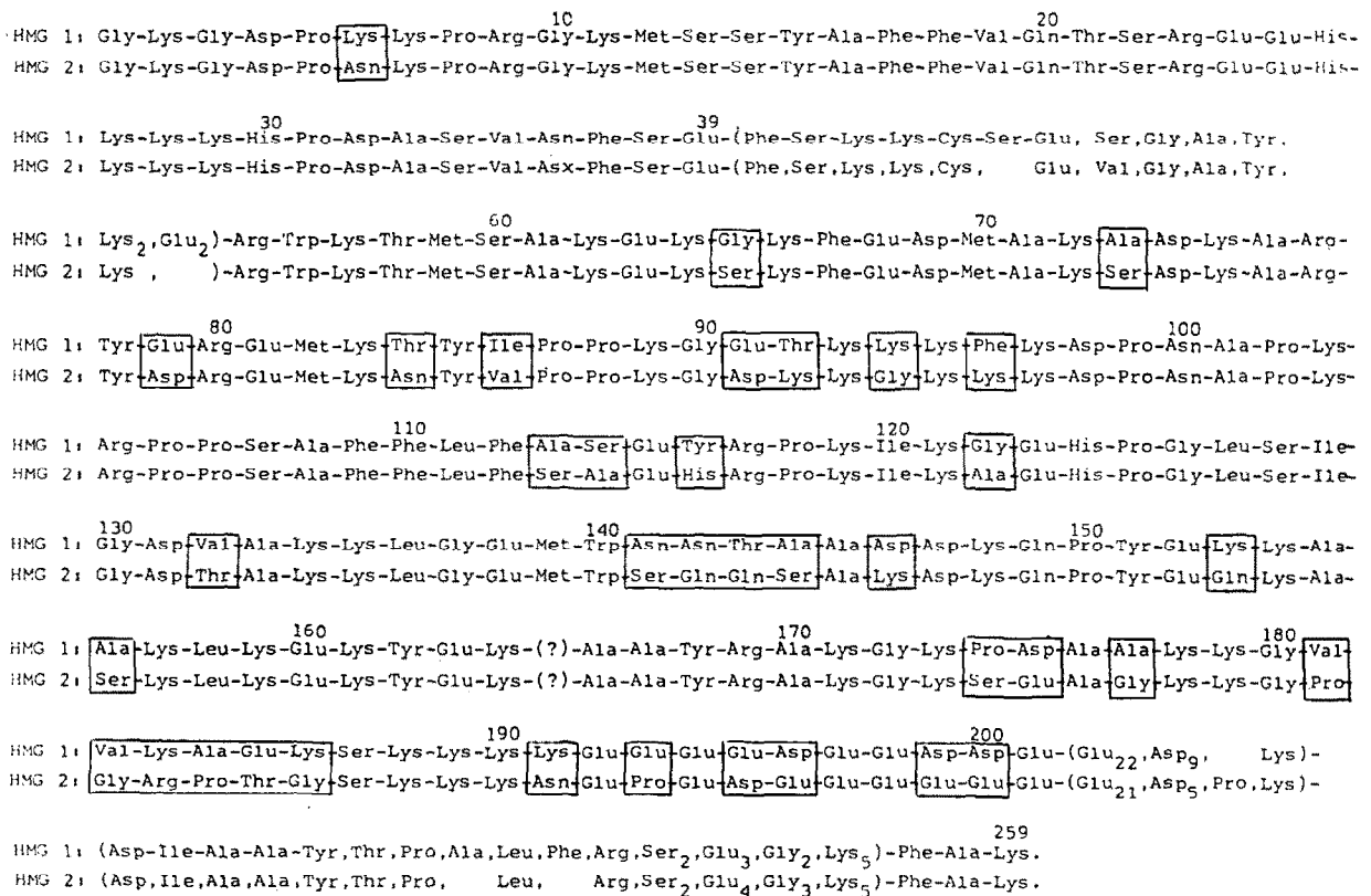
Fig.2. The primary structure of calf thymus HMG 1 and HMG 2.

Analysis of peptide P1 showed peptic cleavage to have occurred essentially at the Phe-Phe bond at residues 109-110, but minor cleavages also occurred at the Phe-Leu and Leu-Phe bonds between residues 110-112. Sequenator analysis of 35 residues of this peptide allowed the overlap of 2 major CNBr peptides CB3 and CB2 [17]. Amino acid analysis showed peptide P1 to extend to the C-terminus of the molecule. Tryptic and V8-protease digestion of peptide P1 provided peptides which covered the majority of the sequence from residues 110 up to and including the HGA sequence which starts at residue 192. Only one unplaced peptide, a tryptic peptide with the partial sequence Asp-Ile-Ala-Tyr was isolated from P1 and this has been placed after the HGA peptide. The C-terminal of the molecule had been determined as -Phe-Ala-Lys in [24]. Comparison of our sequence data with the amino acid analysis of P1 therefore suggests a further 18 residues remain to be placed in sequence after the HGA peptide. Again, the possibility that microheterogeneity exists in this